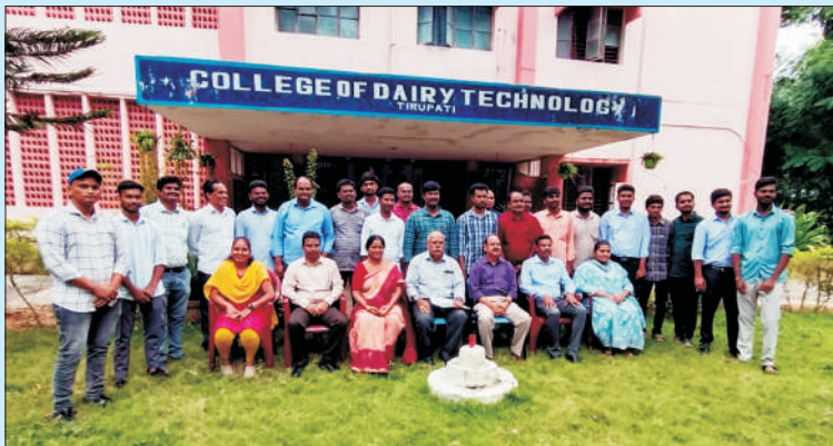
Training Programme on Energy Conservation at CDT, Tirupati

One day training programme on the topic of "Energy conservation in dairy plant" was conducted on 12.11.2024 jointly by Dept. of Dairy Engineering, CDT, Tirupati and Indian Dairy Association - AP Local chapter, Tirupati. About 40 technical staff from different dairies such as Dodla Dairy, Drums Food International Private Limited, Palamaner, Parag Milk Foods Ltd., Palamaner, Sangam Milk Producer Company Limited, Tenali and Srinidhi Dairy, Proddatur attended the training programme.