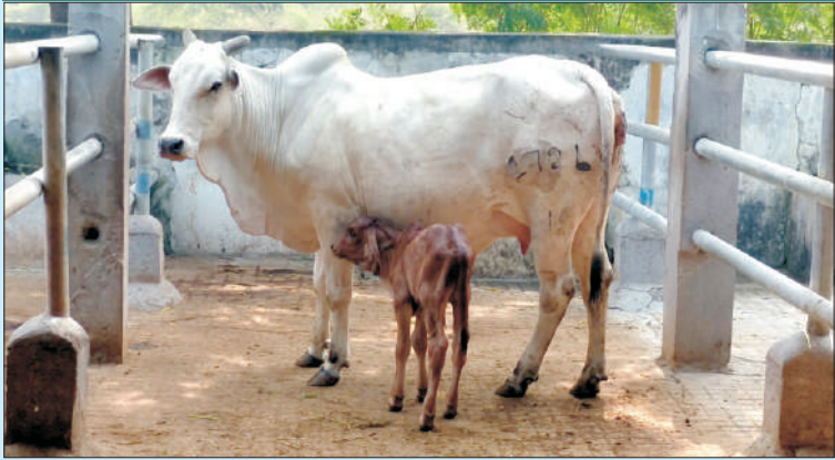
Male IVF Gir Calf Born to a Surrogate Ongole Cow

Livestock Research Station, Lam through its constant endeavours in In-vitro Fertilization Technique and Embryo Transfer Technology (IVF and ETT) reported following achievements in genetic improvement and breed up-gradation: