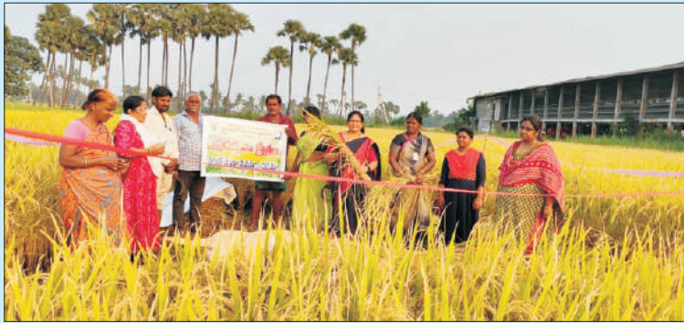
Visit of KVK Team to Paddy Field in Damuluru Village