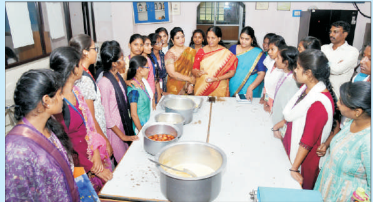
Hands-on Training on Preparation of Dairy Products