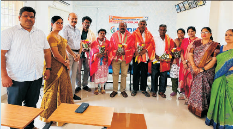
Felicitation of farmers on Kisan Diwas