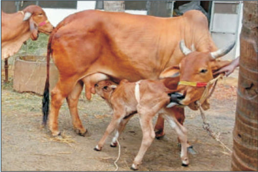
Female IVF-ET Ongole Calf Born to Farmer's Surrogate Cow at Dodleru Village, Guntur District on 12-12-2024

Livestock Research Station, Lam through its constant endeavours in In-vitro Fertilization Technique and Embryo Transfer Technology (IVF and ETT) reported following achievements in genetic improvement and breed up-gradation: