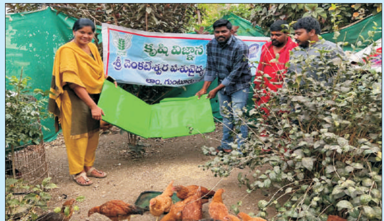
Distribution of Portable Azolla Beds and Poultry Birds to SC Farmers

Three months old chicks (Gramapriya, Aseel and Vanaraja) were distributed to SCSP beneficiaries of Guntur district to promote backyard poultry as an alternate source of income in the months of September and October, 2024. The status of distributed birds were monitored on 26.11.2024 at the beneficiaries' location