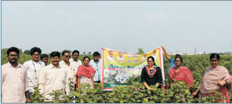
Field Visit to Cotton Field