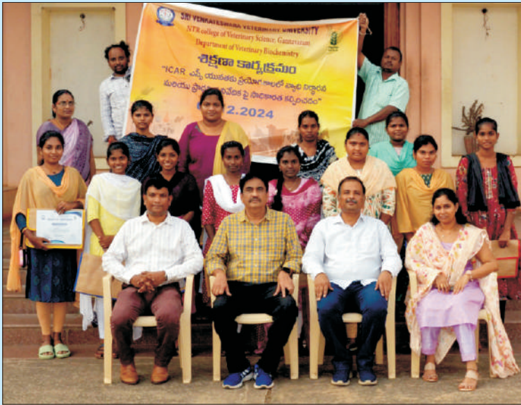
Training Programme on Empowering SC Youth