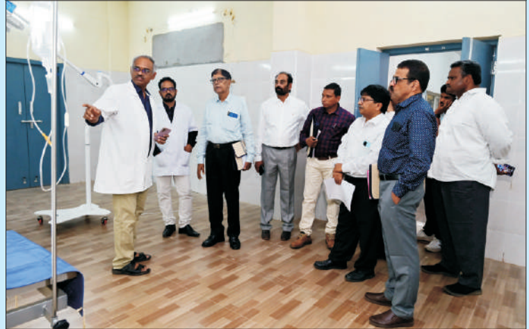
VCI Team Inspecting Facilities at CVSc, Garividi

Veterinary Council of India (VCI) Team visited CVSc, Garividi from 12.11.2024 to 14.11.2024 for inspection and evaluation of facilities for the renewal of 3 rd and 4 th professional years.