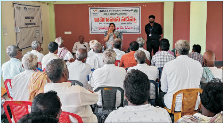
Awareness on Maize and Chilli Cultivation to FPO Staff