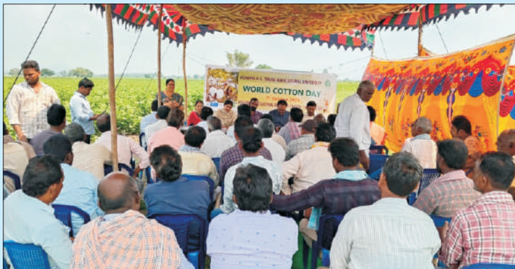
Training Programme on ICM Practices in Cotton