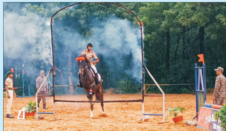
Horse Show at CVSc, Tirupati

On 18.12.2024, 2(A) R&V NCC Regiment of CVSc, Tirupati organized a blood donation camp and horse show on account of visit of Sri Ram Prasad Reddy, Hon'ble Minister for Sports and Youth Affairs, Andhra Pradesh.