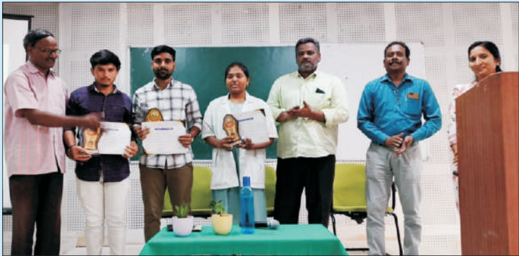
Prize Distribution at CVSc, Garividi