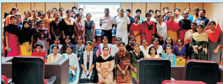
National Pollution Control Day Celebration at NTR CVSc, Gannavaram