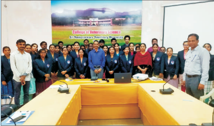
Yuvamanthan Models Organized at CVSc, Tirupati