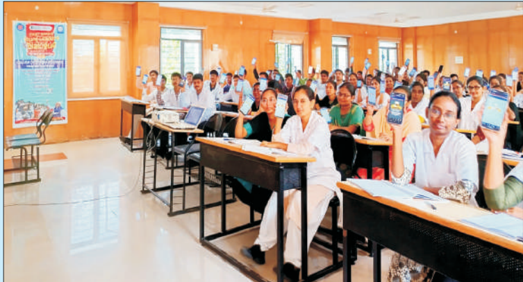
Students of CVSc, Proddatur Registering on the Portal

The students of CVSc, Proddatur actively participated in the Viksit Bharat Young Leaders dialogue- 2025 on 05.12.2024, by registering in the portal under the guidance of NSS team and other faculty.