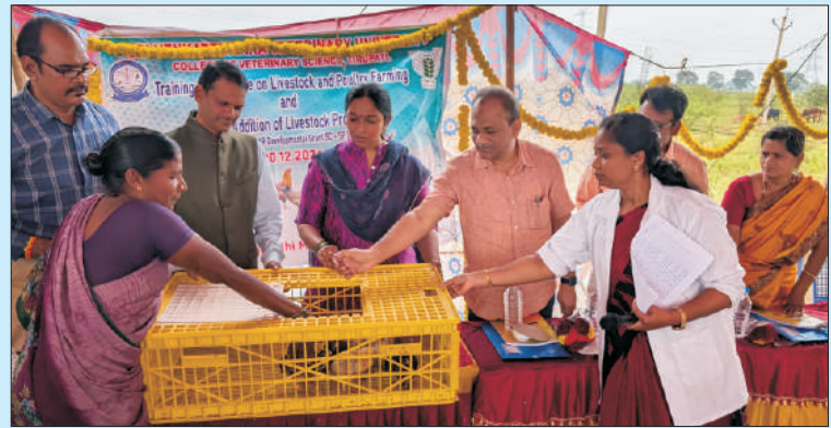
Backyard Poultry Distribution to Beneficiaries