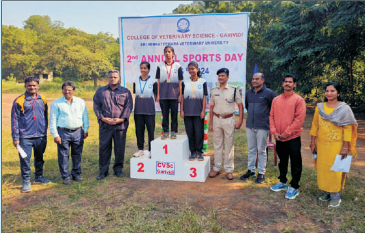
Prize Distribution to the Winners During Sports Day

Second Annual Sports Day was conducted on 16 th December, 2024 at CVSc, Garividi with various outdoor games including running, javelin throw, shot put speed walk etc. Prizes were awarded to the winners.