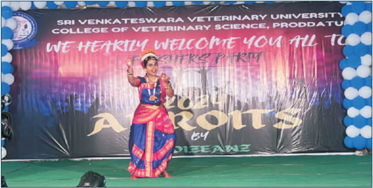
Cultural Activity at CVSc, Proddatur