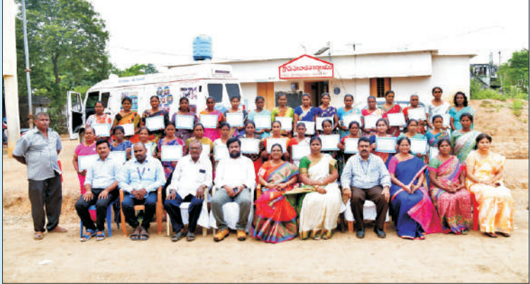
Participants of Training Programme with Certificates along with Dignitaries and Organizing Committee