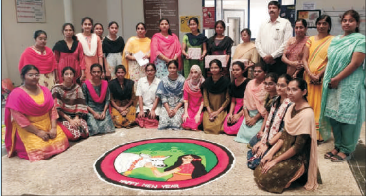
Staff and Students of CVSc, Proddatur at Rangoli Competition