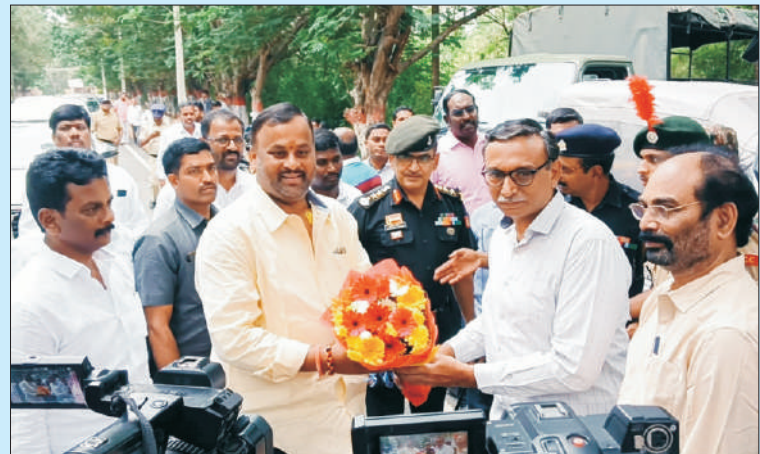
Sri Ram Prasad Reddy, Hon'ble Minister for Sports and Youth Affairs, AP welcomed by Dr. J. V. Ramana, Hon'ble VC (I/c), SVVU, Tirupati

On 18.12.2024, 2(A) R&V NCC Regiment of CVSc, Tirupati organized a blood donation camp and horse show on account of visit of Sri Ram Prasad Reddy, Hon'ble Minister for Sports and Youth Affairs, Andhra Pradesh.