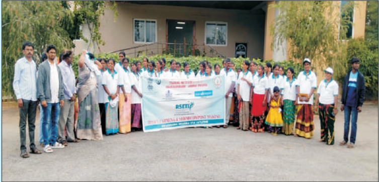
Rural Development & Self Employment Training at LRS, Siddarampuram

Livestock Research Station, Siddarampuram conducted training on different fodder varieties, complete feed preparation, sheep-goat farm management and vermicompost making to 50 participants from Rural Development & Self Employment Training Institute, Anantapuramu.