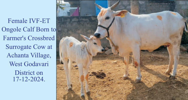
Female IVF-ET Ongole Calf Born to Farmer's Crossbred Surrogate Cow at Achanta Village, West Godavari District on 17-12-2024.