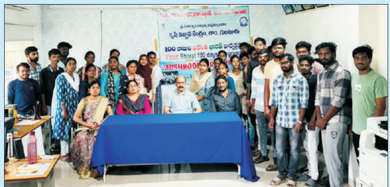
Oyster Mushroom Production Training at KVK, Lam