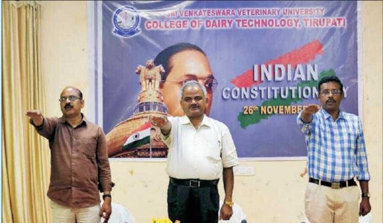
Constitution Day Celebration at CDT, Tirupati