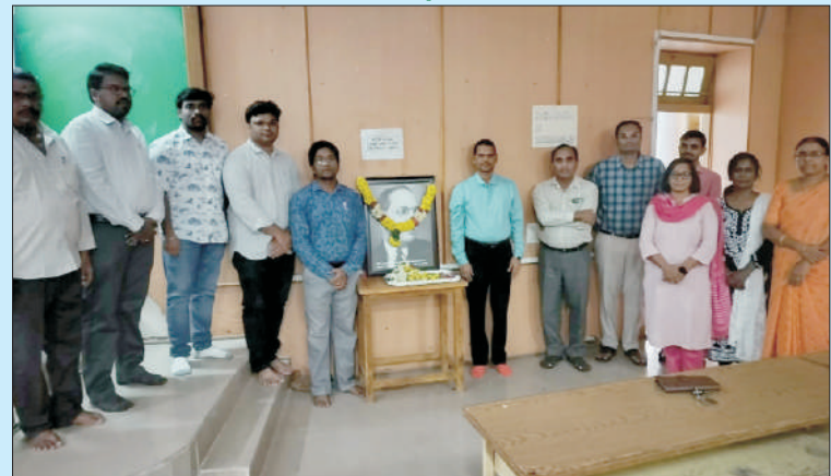
Constitution Day Celebration at CVSc, Tirupati

Constitution Day was celebrated on 26.11.2024 at all colleges of SVVU to educate students about the significance of the Constitution and to foster a culture of respect, inclusivity and civic responsibility among students. Poster making and essay writing competitions were conducted and certificates were distributed to the winners by Associate Deans of respective colleges.