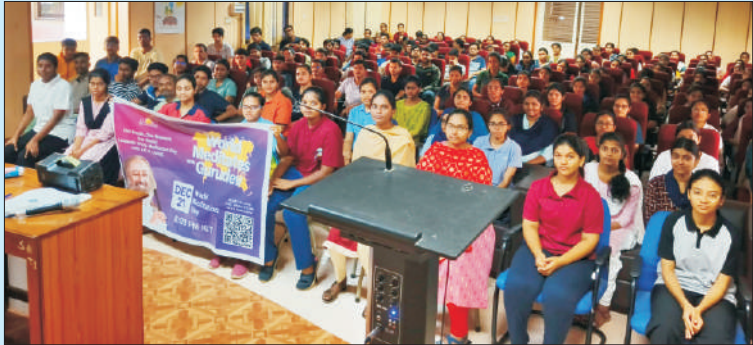
World Meditation Day Celebration at NTR CVSc, Gannavaram

On 21-12-2024, World Meditation Day was celebrated at CVSc, Proddatur and NTR CVSc, Gannavaram.