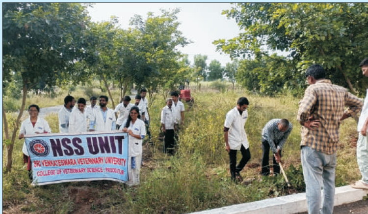
NSS Students Participating in "Swachhta hi Seva" Activity

NSS unit of CVSc, Proddatur conducted "Swachhta hi seva" programme at college premises and students actively participated in the activity.