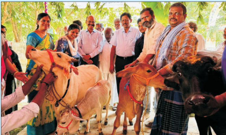
Rally of Calves Born by Using Sex Sorted Semen

Krishi Vigyan Kendra, Lam in collaboration with the Andhra Pradesh Livestock Development Authority (APLDA) has initiated intervention to promote the use of sex-sorted semen (SSS) among