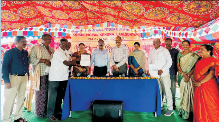
Soil Health Card Distribution to Farmers