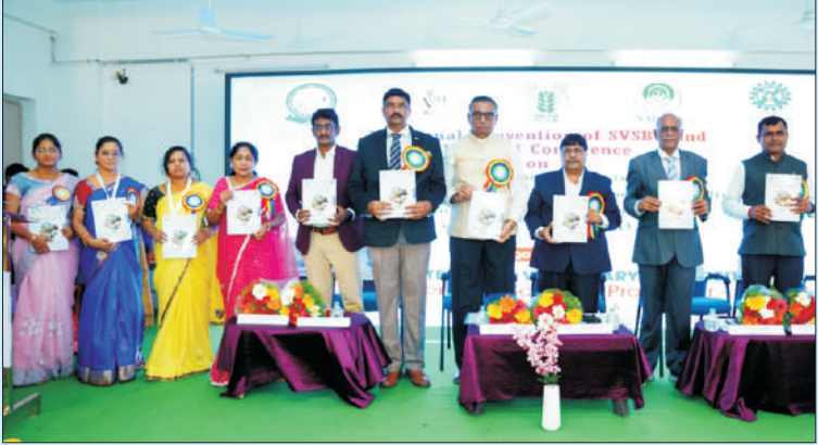
Release of Compendium at SVSBT Conference