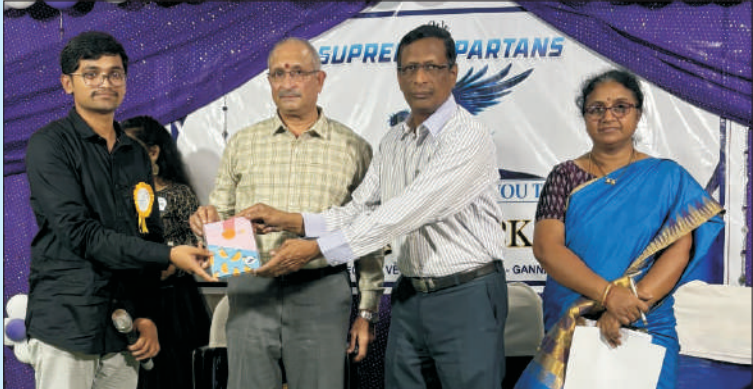
Fresher's Day Celebration at NTR CVSc, Gannavaram