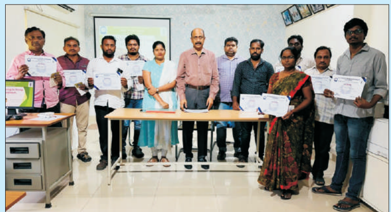
Trainees with Certificates of Start-up Training to Sheep Entrepreneurs

A three days training programme on "Start-up training to sheep entrepreneurs" was conducted at KVK, Lam to rural youth and Nandana FPO members from 16 th to 18 th November, 2024 on scientific sheep managerial practices, housing and different