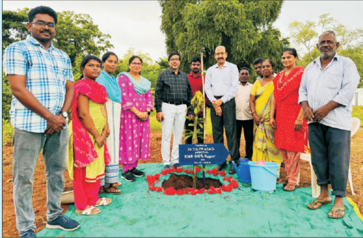
Tree Plantation at KVK, Lam